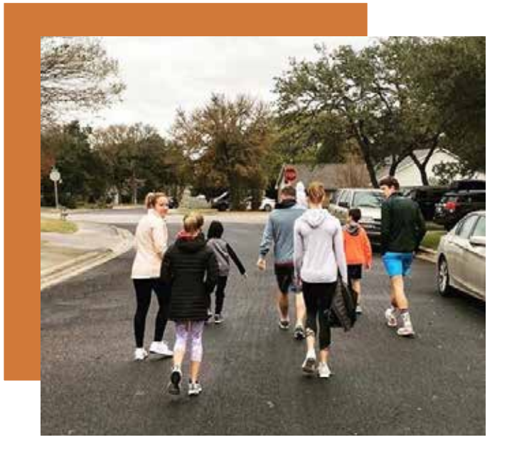
Turkey Trot participants on the run