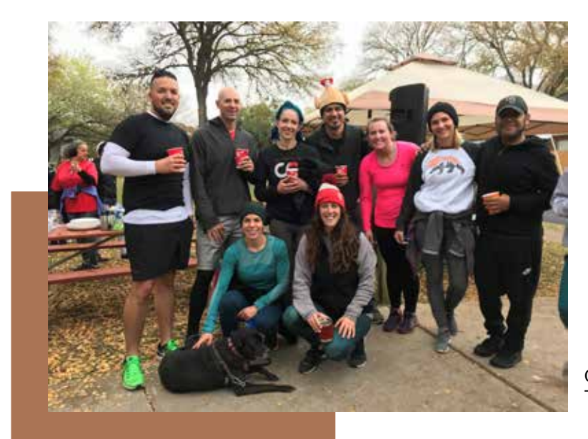
Camp Gladiator Celebrating at the Turkey Trot