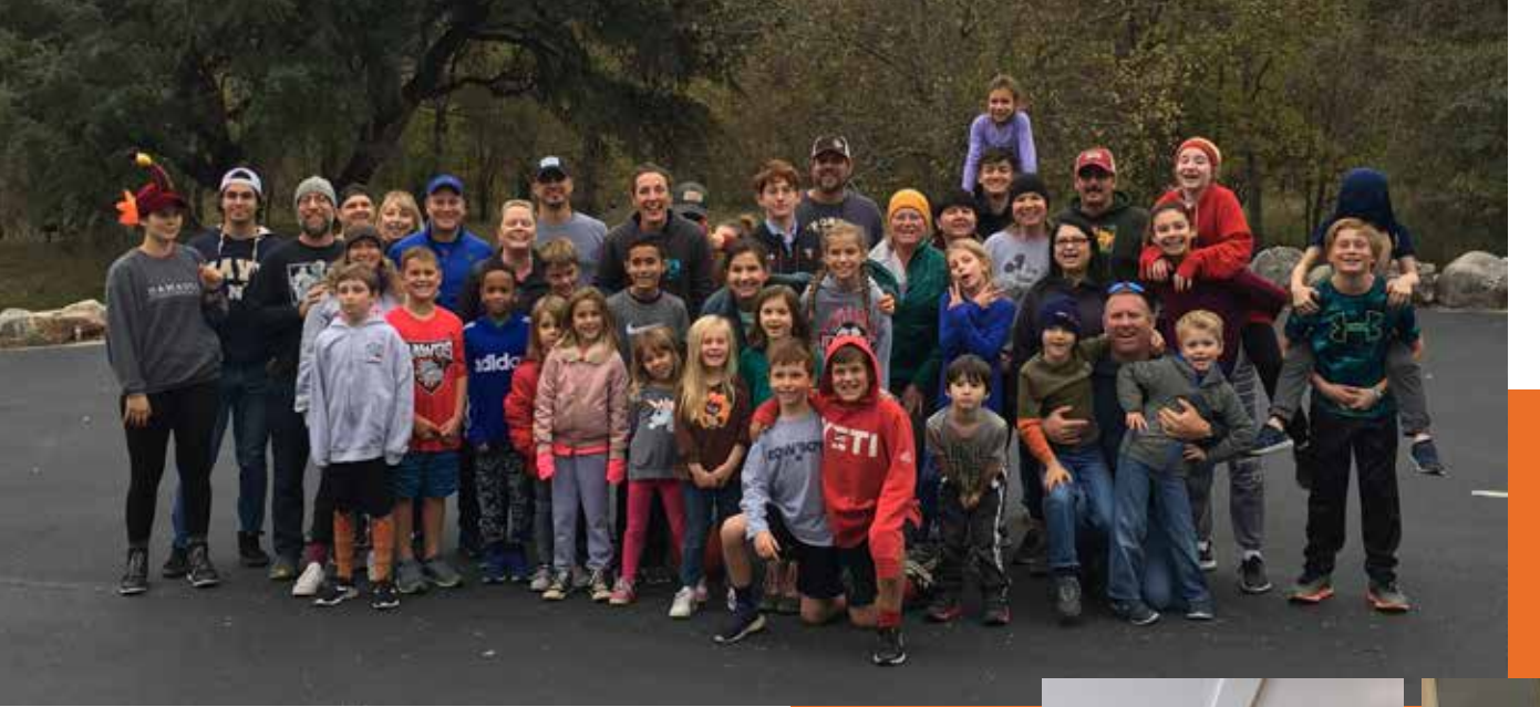
Turkey Legs vs Canned Yams Kickball Event