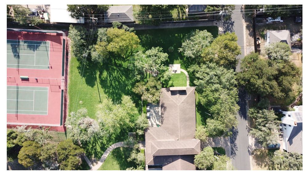
Lot development adjacent to Community Center