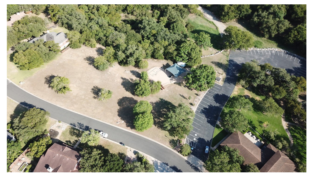
Development behind Community Center